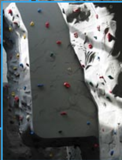
Counter-clockwise from above: Freeform combined with Imprint at UW, Crystal Panel and Imprint at OSU, Imprint combined with "airbrushed" Crystal Panel